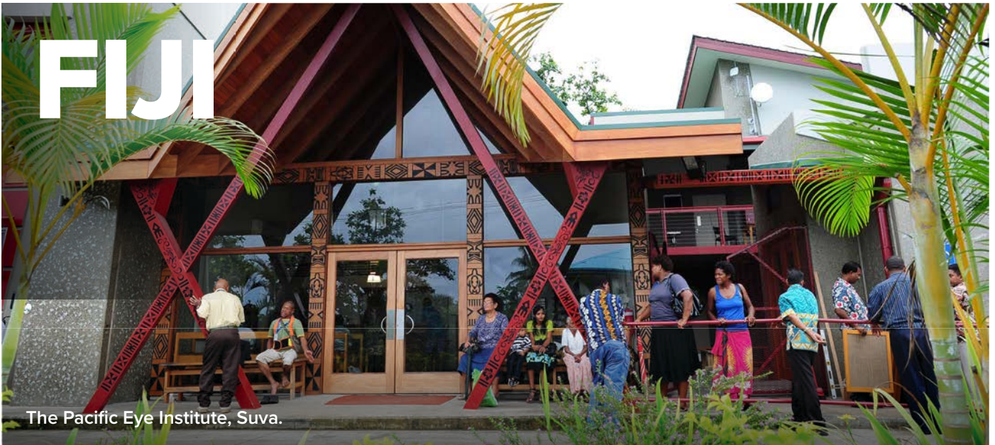
The Pacific Eye Institute, Suva.

The Foundation assists the Ministry of Health and Medical Services of Fiji, through the Pacific Eye Institute based in Suva, to deliver comprehensive eye care services to tens of thousands of Fijians each year.