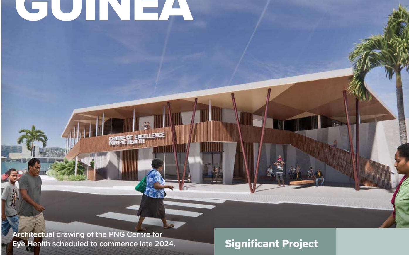
Architectural drawing of the PNG Centre for Eye Health scheduled to commence late 2024.