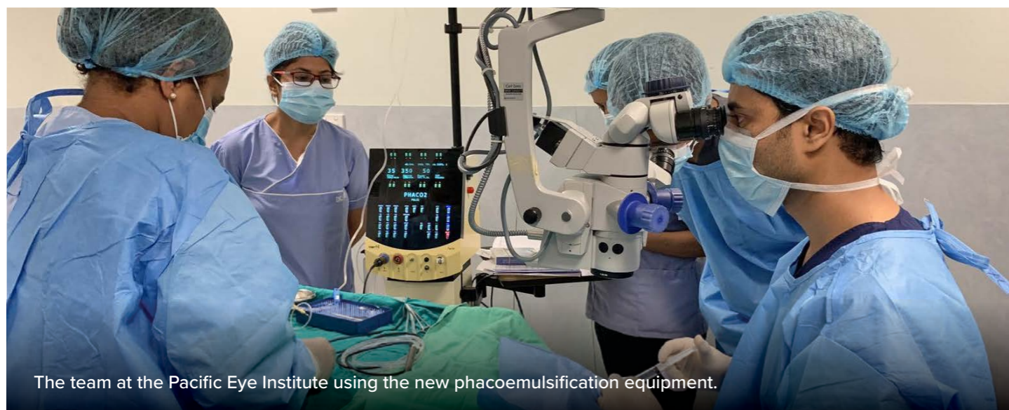
The team at the Pacific Eye Institute using the new phacoemulsification equipment.

This key milestone expands the range of eye services offered across the Pacific and is a cost-effective long-term solution to eye care in the Pacific.