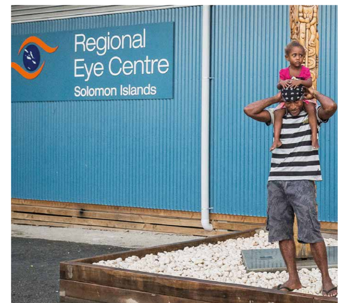
above: The opening of the new Regional Eye Centre in Honiara means all people in the Solomon Islands now have access to world-class eye care.

By choosing to support The Fred Hollows Foundation you are helping us invest in long-term, sustainable solutions to end preventable blindness in the Pacific. Thank you for your support.