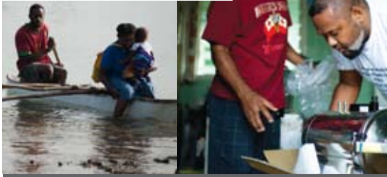
Left: Many patients travelled to Malekula by boat from neighbouring islands. Right: The surgical team setting up a temporary eye clinic at Norsup Hospital on the island of Malekula.

Access: Vanuatu is an archipelago of 82 volcanic islands with a scattered population of around 234,000. The high cost of land and sea transport makes access to eye health services extremely difficult, especially for the 76 per cent of the population who live in remote, rural areas.